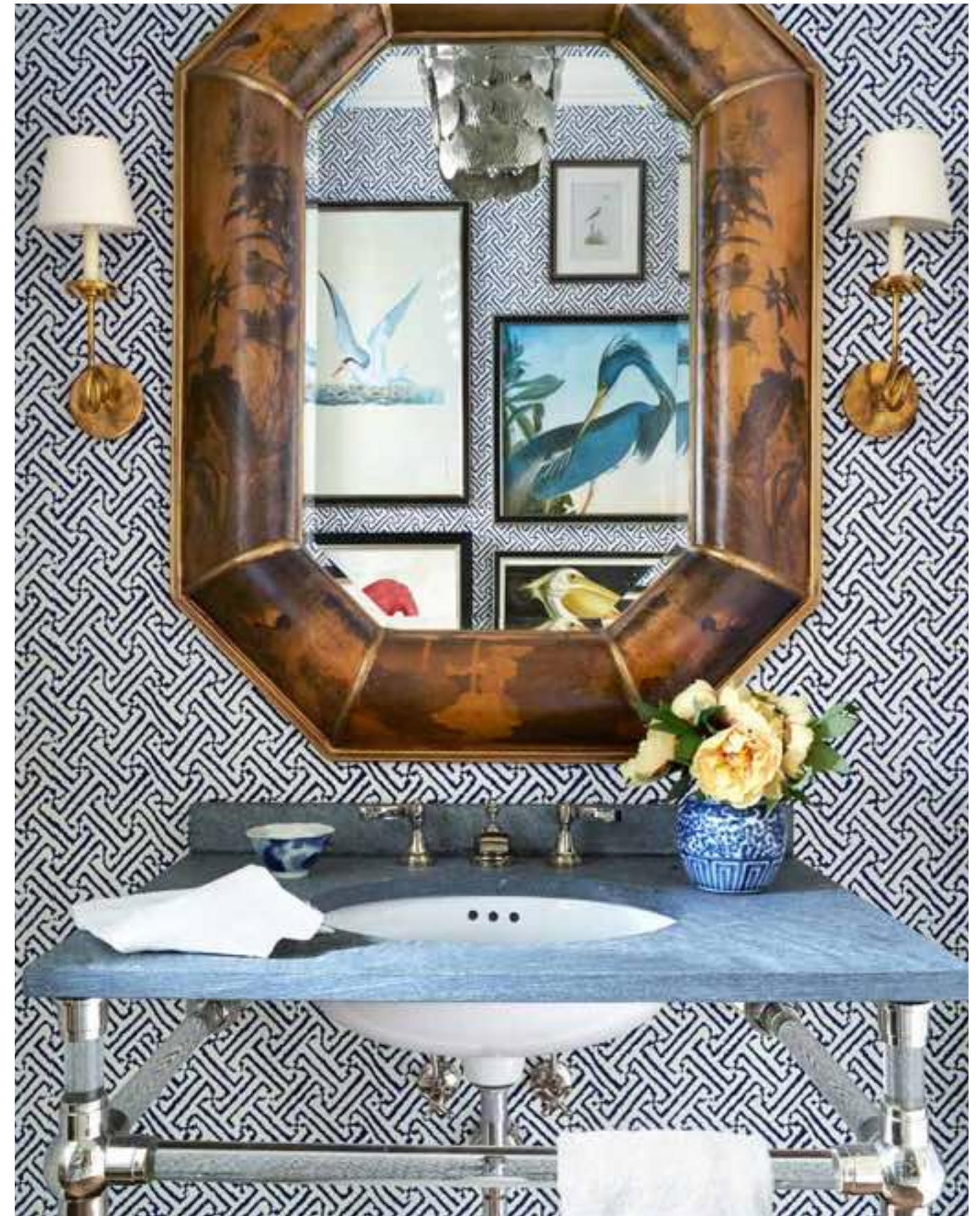
ABOVE: Java Grande wallpaper from China Seas is a bold backdrop for the powder room. The mirror is vintage. Gramercy Glass washstand, Restoration Hardware. OPPOSITE: Calais tiles from Granada Tile enliven the lanai and carry the home's profusion of blue and white outdoors. Wicker furniture from Kingsley-Bate with cushions in Perennials' Rough 'n Rowdy fabric surrounds the Bornova coffee table from Ballard Designs.